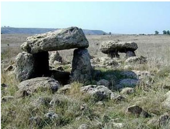
Dolmen in the Golan, Israel

Whatever the case, Jeremiah speaks of the existence of physical (historical and archaeological) "signs" meaning evidence that should be studied to enable the return of the Lost Israelites. This involves the study of archaeological finds. It also includes historical research in general including a comparison of Ancient Israelite customs, legends, historical documents, linguistics, and related subjects. Such evidence exists, is plentiful, and despite some difficulties is available. A great deal of academic prejudice and inhibition does impede an objective consideration of our findings. These can be overcome. The evidence is available and needs to be examined.